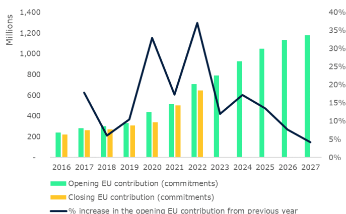
Figure 2 EU contribution to Frontex (2016-2027)

Source: ICF, based EU budget data from MFF 2014-2020 and MFF 2021-27.