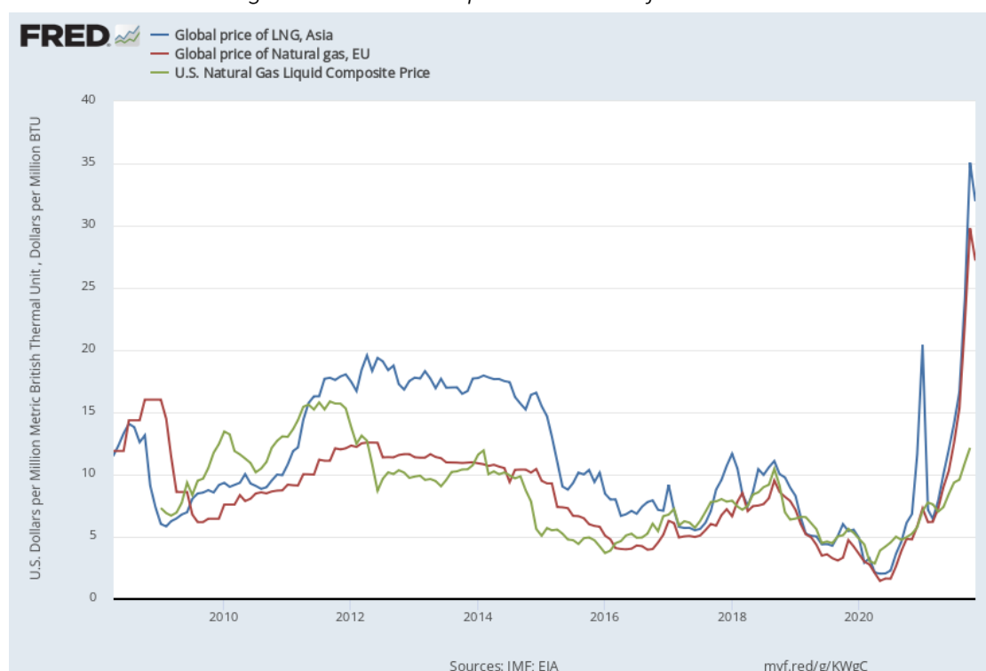
Figure 2. Global LNG prices in the major markets

Russian gas is still cheaper, but the political price has now become unacceptable. Luckily, Europe already has enough capacity to import LNG to be able to offset a hypothetical loss of Russian gas . But this potential could be much more fully used when needed.