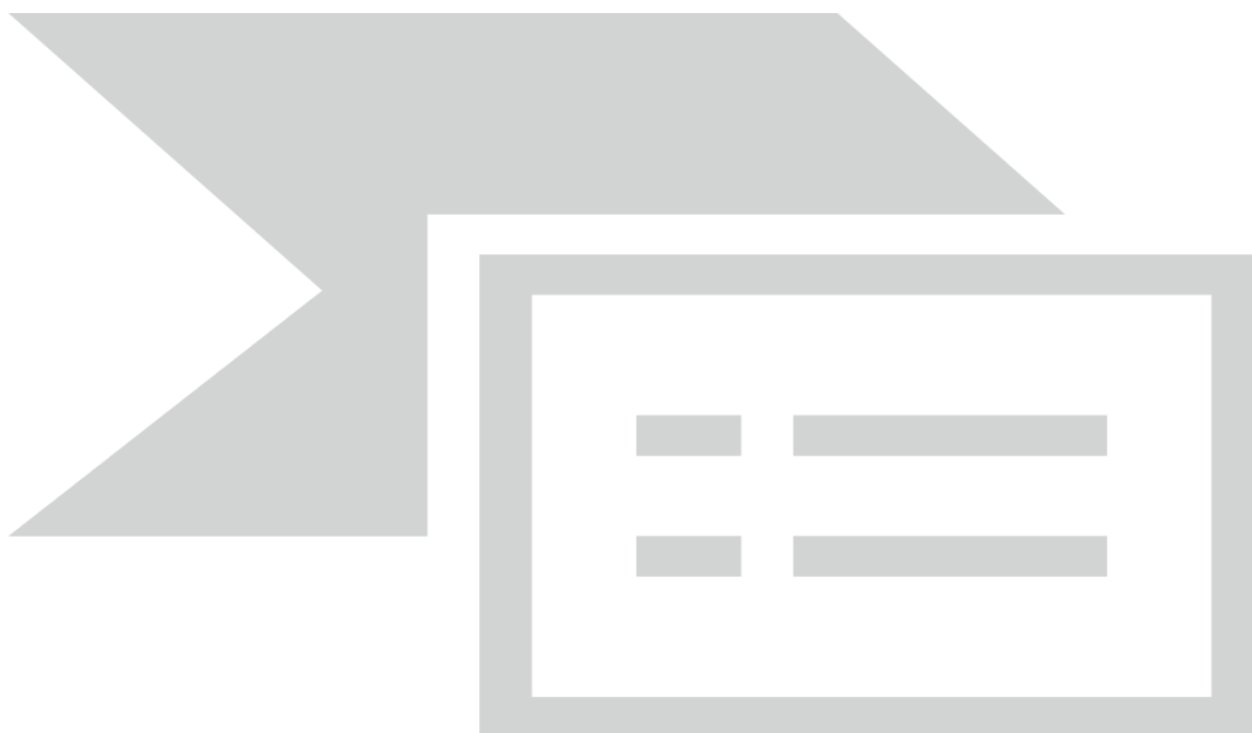
Figure 5: Average annual investment need 2021-30 (Source: Commission modelling).

The transition towards climate neutrality means a profound change for our economies. Identifying investment needs and securing the necessary funding is essential to deliver the yearly additional investment of around EUR 260 billion 24 necessary to achieve the EU's climate and energy targets by 2030. NECPs can be an important tool to plan national investments in the areas of energy and climate. Public funding will also be necessary to upgrade of digital and sustainable skills, to boost the recycling facilities and the renovation of public buildings and to maintain and renovate infrastructure. The coordination of new investments between public authorities, private sectors and citizens will mainstream funding, avoid stranded assets and address new needs for businesses and citizens.