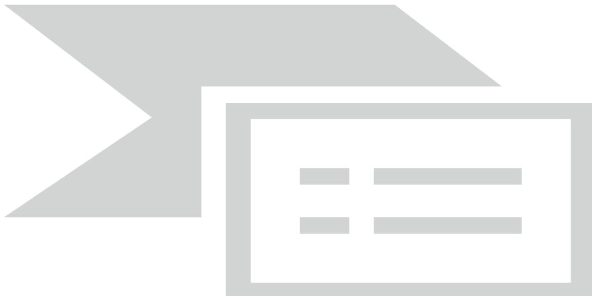
Figure 2: National renewables contributions (Source: EU Commission calculations based on information from the draft NECPs).