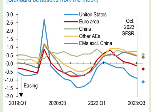
Sources: Bloomberg Finance L.P.; Haver Analytics; national data sources; and IMF staff calculations. Note: Data for 4Q23 end uses high-frequency proxy values; AEs = advanced economies; EMs = emerging markets. excl. = excluding; GFSR = Global Financial Stability Report.