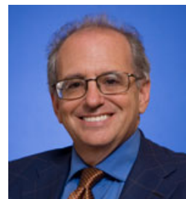
Norman J. Ornstein is a resident scholar at the American Enterprise Institute.

One year ago we issued a report evaluating the first session of the 110 th Congress. We compiled statistics on how Congress spent its time; what it achieved; and how the legislative process operated relative to the 109 th Congress under unified Republican government and to the more comparable situation of the 104 th Congress following the 1994 election, when a new Republican majority in both houses took office under a Democratic president. This report extends our analysis to the full, two-year 110 th