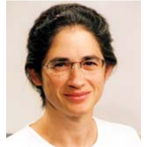
Sarah A. Binder is a senior fellow in Governance Studies at Brookings.

These patterns of dysfunctional behavior in Congress and the other branches of government are at least partly natural and understandable responses to powerful forces in the political and social environment. This is a strikingly partisan era characterized by two strong and ideologically polarized parties with consistently narrow margins in both houses of Congress. These features of the party system are evident among elected officials in government and within the electorate. They are