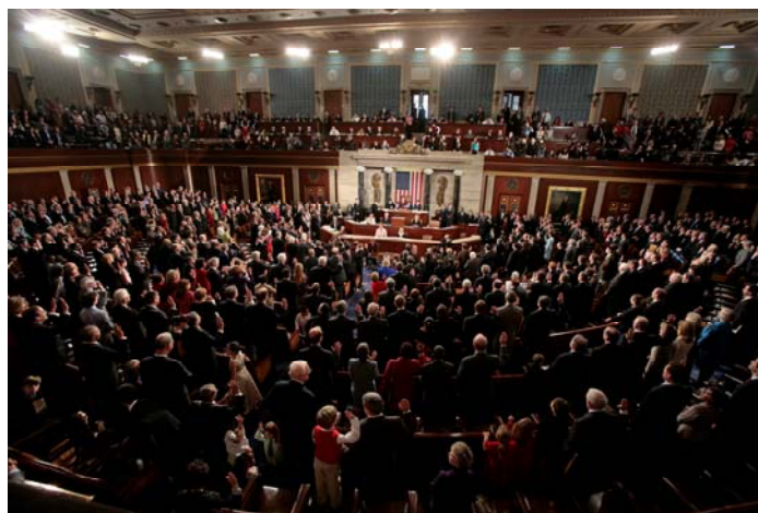
U.S. Speaker of the House Pelosi swears the members of the U.S. House of Representatives into office on the first day of the 110th Congress in Washington.

Barack Obama's triumphant presidential campaign in the 2008 election generated extraordinary interest and excitement in the United States and around the globe. Following on the heels of sweeping Democratic gains in 2006, this second Democratic victory was driven by a sharply negative referendum