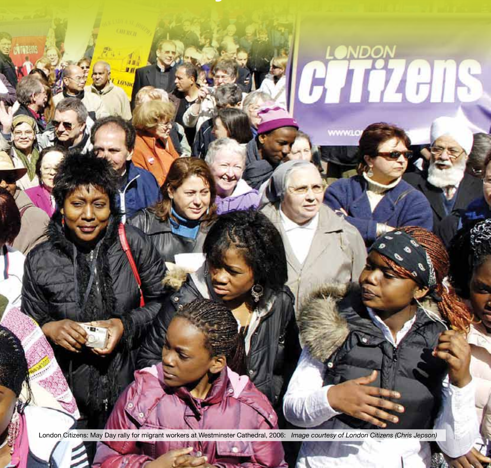
London Citizens: May Day rally for migrant workers at Westminster Cathedral, 2006: Image courtesy of London Citizens (Chris Jepson)